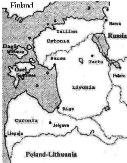
The historic Baltic Provinces.

The area of Jewish settlement closest to (the University of) Tartu (belonging to the educational circle of Tartu / Riga) was the Province of Curonia ( Kurland ) — see the Map. Until the year 1882 most of the